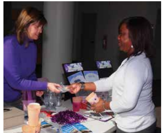
Primerica employees raise money for Relay for Life.