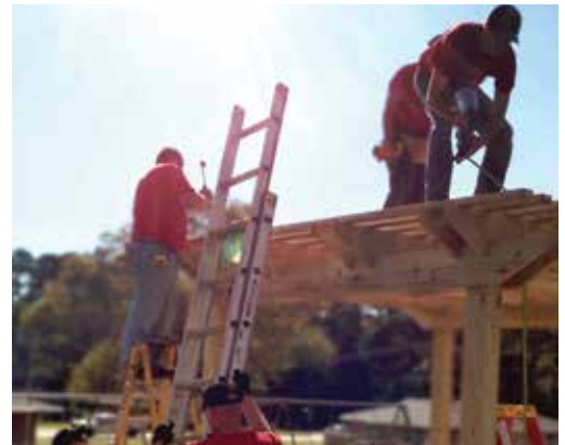
Primerica employees volunteer for Gwinnett Great Day of Service.