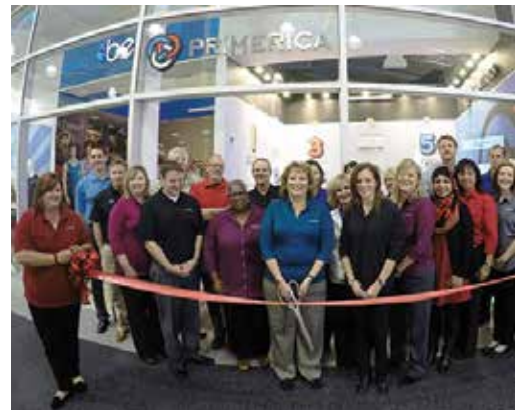
Grand opening ribbon cutting of Primerica's storefront in JA Finance Park.